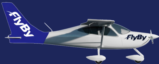
Tecnam P2008JC 17 in fleet

The Tecnam P2006T is a twin-engine, four-seat aircraft with fully retractable landing gear. Inside, the Tecnam uses a glass cockpit configuration with Garmin avionics, on large-format, high resolution displays.