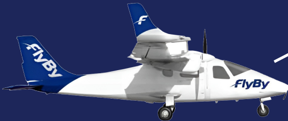
Tecnam P2006T 5 in fleet

The Tecnam P2006T is a twin-engine, four-seat aircraft with fully retractable landing gear. Inside, the Tecnam uses a glass cockpit configuration with Garmin avionics, on large-format, high resolution displays.