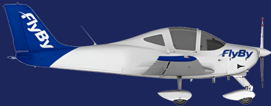
Tecnam P2002JF 2 in fleet

The Tecnam P2008JC MkII is a symphony of up-to-date technology and composite fuselage, safe and easy flying with beauty both inside and outside.